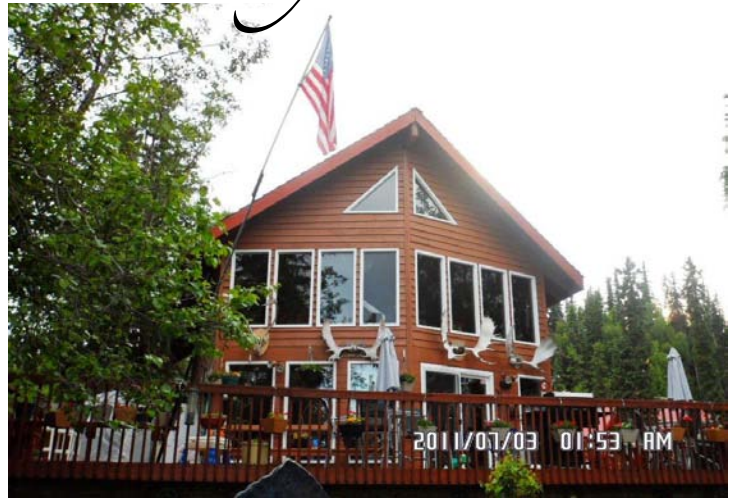
One of the camp cabins with a fire smouldering in the pit. The Kenai is 25 ft. behind the photographer.

Immediately following the great time at Joe's we began the three hour, 140 mile drive to the Kenai River and the quaint little town of Sterling, Alaska. The Chugash Mountain range followed us for nearly the whole trip. They were, to the last one, snow capped and beautiful in July. Out of nowhere, a left a right and another left, a dirt road, a steeply descending driveway and we were