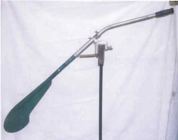
The Ger. Rauglas, Inc. Scull-Ez, made in Minneola, FL from 1946.