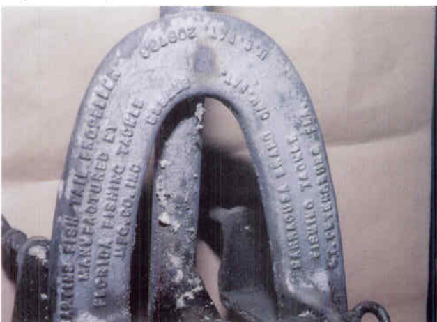
Martin's Fishtail Propeller yoke, recast with Florida Fishing Tackle Mfg. Co. Inc.'s Barracuda Brand inscription from St. Petersburg, FL.

Yet another innovation was to make the oar handle out of a flat board and cut a hole in the flat area into which you could insert your arm. All of these arrangements were actually manufactured, although I am not aware of either of the two Scull Master types being made in Florida. The latter one with the hole in the handle was handmade here in the state.