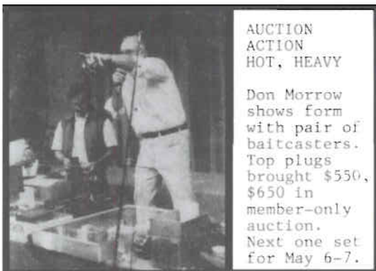
AUCTION ACTION HOT, HEAVY

24 NFLCC members registered, plus 58 non-members and "casual accumulators" Auction: $1,300 Meet profit: $124 to benefit the Orange County Historical Museum