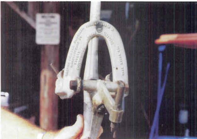
Martin's Fishtail Propeller yoke, cast with the Lovell Enterprises, Blue Ridge, GA inscription.