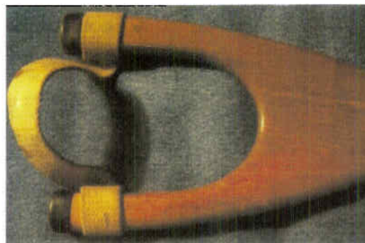
These photos of the Scull Master, an Arkansas sculler manufactured by Ben Pearson (the archery company) in Pine Bluff, provide another variation with which to compare the four known Florida scullers.